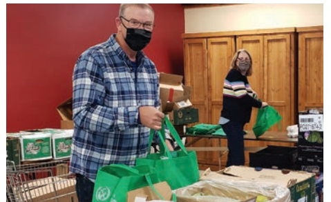
Sauk Prairie Area Food Pantry