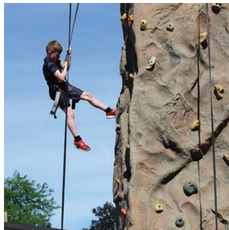
Portable climbing wall in Lodi

Funds were used to engage students in activities along the Ice Age National Scenic Trail, helping to educate them about the State of Wisconsin and develop healthy lifestyle habits.